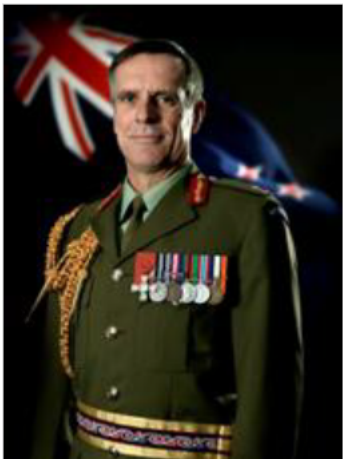
Lieutenant General Tim Keating Chief of Defence Force

Veterans' Affairs sits within the People Capability Portfolio of NZDF and is responsible to the Chief of Defence Force.